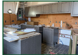
Cabinetry installed inside of new café

A committee is now taking shape to select a café manager and formulate a healthy menu for adults and children alike. The Foundation is certainly aware of the potential problem of litter from café serving containers. We will work with the operator to ensure procedures are put in place for minimal food packaging. Watch our website for the opening announcement and full details of the menu.