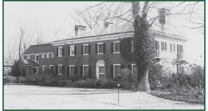
Summer Cottage circa 1935