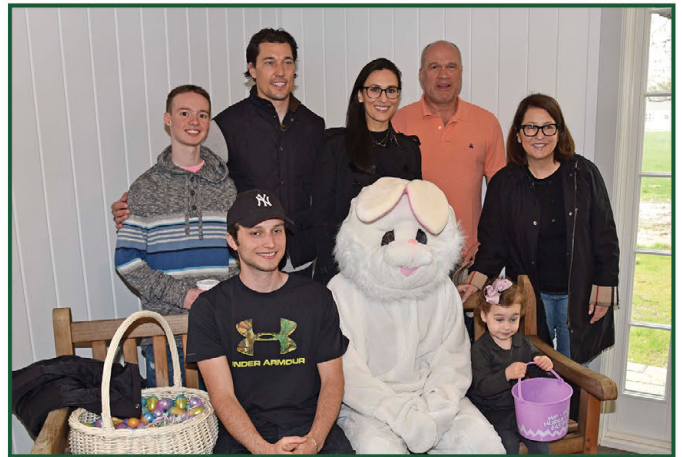
Member’s Egg Hunt