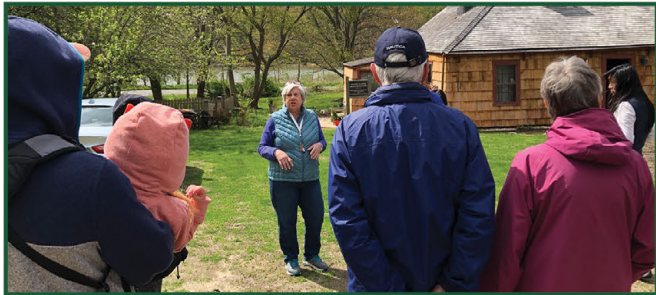
Daffodil Hill Hike to the Henry Lloyd Manor House