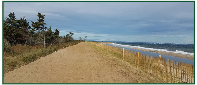
Completed Berm Project

Construction used existing rubble on the beach, with sand added to the top. Native vegetation was then placed along both sides. This restoration will help protect the integrity of the tidal wetland and allow patrons to once again walk along the raised trail down to Plank Road.