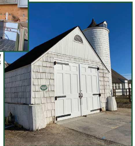
Home of new café