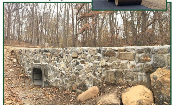
New entrance road