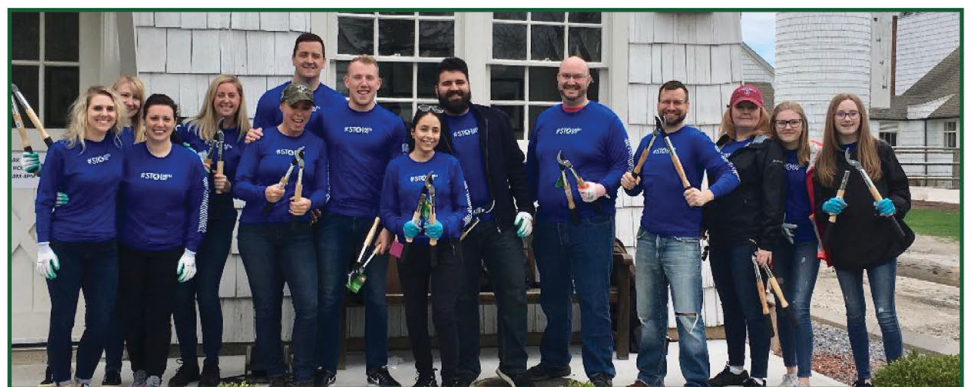
Volunteers celebrate Earth Day at Caumsett by cutting back invasive plants

In 2019, participants volunteered in 22 efforts totaling approximately 285 man-hours of work. Large company participation increased and included several new groups. Over 50% of the work involved invasive plant removal. Other tasks involved preparing and planting native species, beach cleanup and management of the Baltimore Checkerspot butterfly colonies. There is a long list of projects to be completed at the park. If you or your company would like to donate time and resources any of our environmental projects please contact: suefeustel@optonline.net